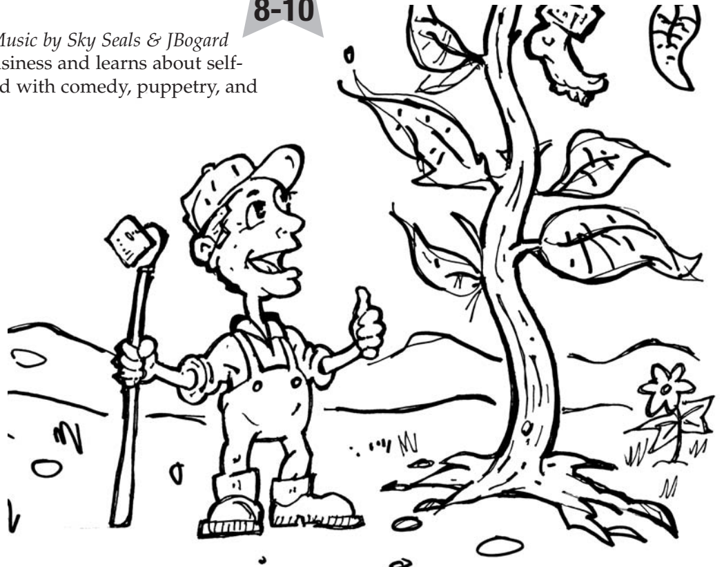
Color the picture. -- Can you find Jack in this scene?

FARMER: Food that's grown close to home travels fewer miles. It's cleaner, fresher, and the farmers can shake your hand and give you delicious recipes. I make a terrific beanstalk casserole, but the portions are giant.